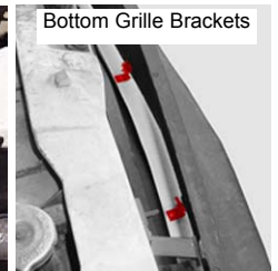
Bottom Grille Brackets

STEP 3 Attach (2)-Z brackets to the top of the billet grille, and attach the (2)-Small brackets to bottom of billet grille. Set billet grille in place. Next mark the locations where the brackets meet the core support & on lower valence. Drill 3/32 holes at each marked locations. NOTE:(Z-BRACKETS ARE LEFT & RIGHT)