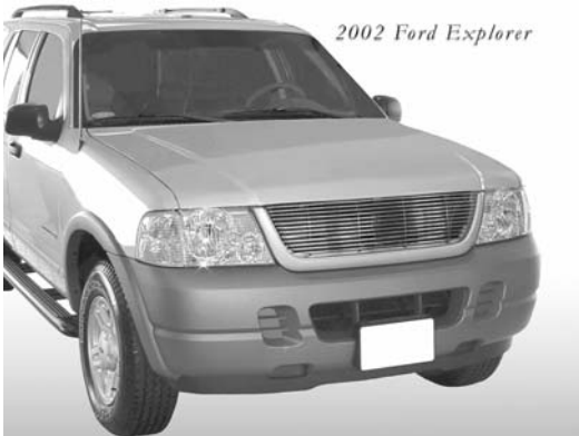
2002 Ford Explorer

6 - #8 x 5/8" Phillips Pan head black screws.