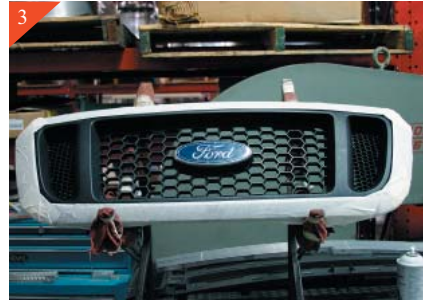
3 Remove grille shell from vehicle and tape the face of the stock grille shell with masking tape to protect during installation.