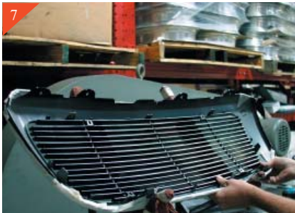
7 Place Billet Grille into opening and center.