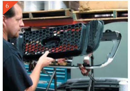
6 After clipping all tabs, remove the center portion of stock grille shell as shown above.