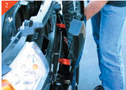
2 There are (2) Clips at the bottom of the grille shell that you release by squeezing together. Grille shell will be free at this point.