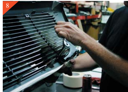
8 Next using the "L" shaped bracket you will be attaching the lower part of billet grille to the stock shell. The Long end of the bracket attaches to the billet grille using the supplied 1/4-20 x 3/4" Soc Cap Screw & 1/4-20 safety nut and tighten.