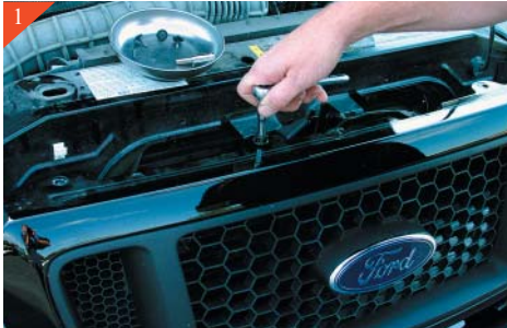
1 Open hood and remove the (4) - 7/32" bolts across top of core support.