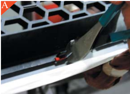
A Lay grille face down on a protective surface such as a blanket. Next using a pair of cutting pliers (Fig A.), Clip the release tabs and then using a regular screwdriver pry out to release the tabs (Fig B).

NOTE: If you plan on keeping the inner portion of stock grille shell you will need to hand release. Do not cut tabs.