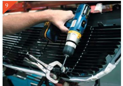
9 Re-center billet grille in opening and make flush with the face of the stock grille shell. Using a pair of vice grips clamp bracket in place. Next using a 1/4" drill bit, drill down thru the bracket as shown above.